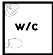
changing area 2 2m x 2m